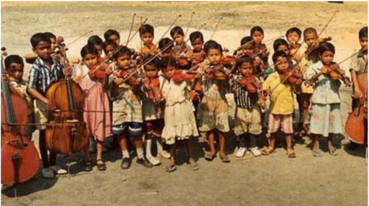
Mathieson Music School, Calcutta