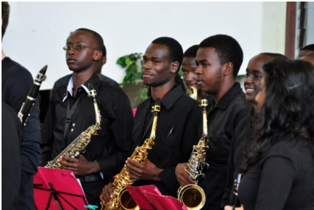
National Youth Orchestra of Kenya