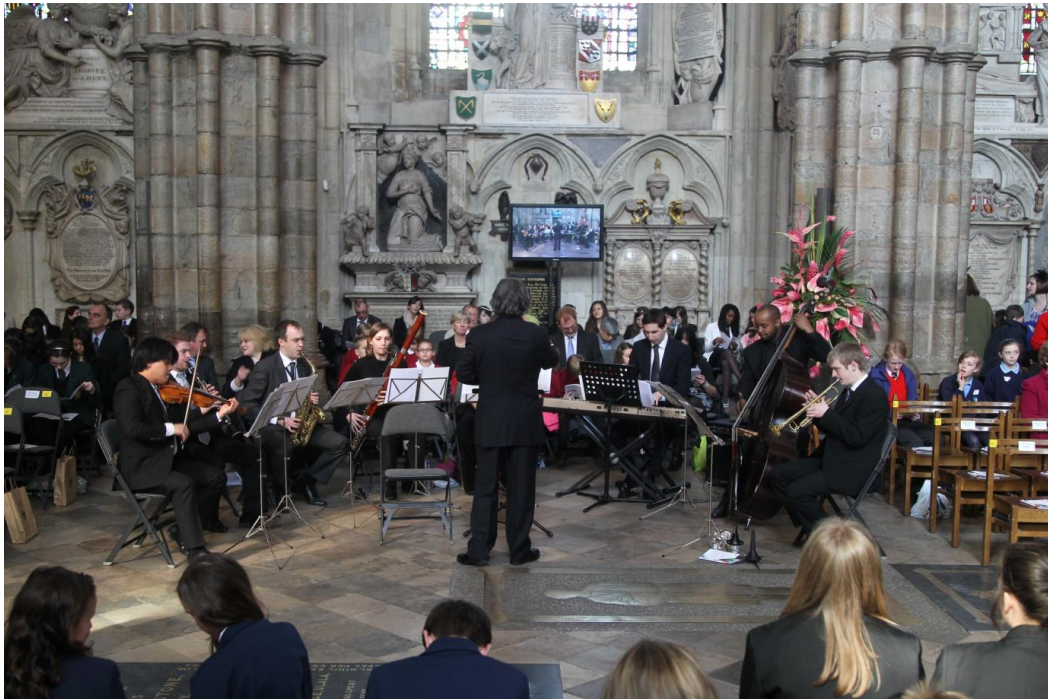
Commonwealth Day 2012: The Commonwealth Observance Members of The Commonwealth Youth Orchestra.