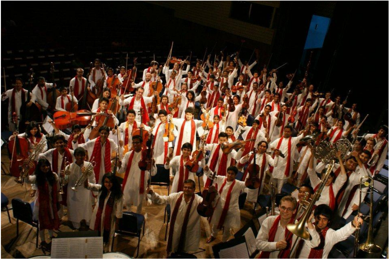
National Youth Orchestra of India