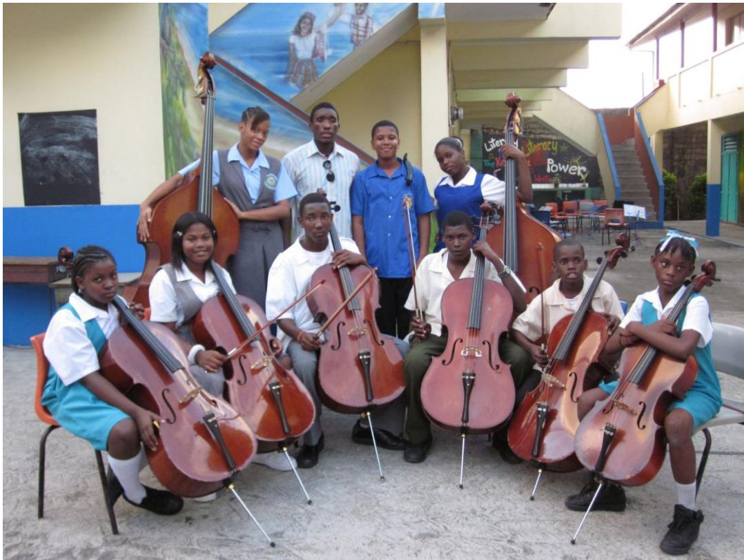
St Lucia School of Music